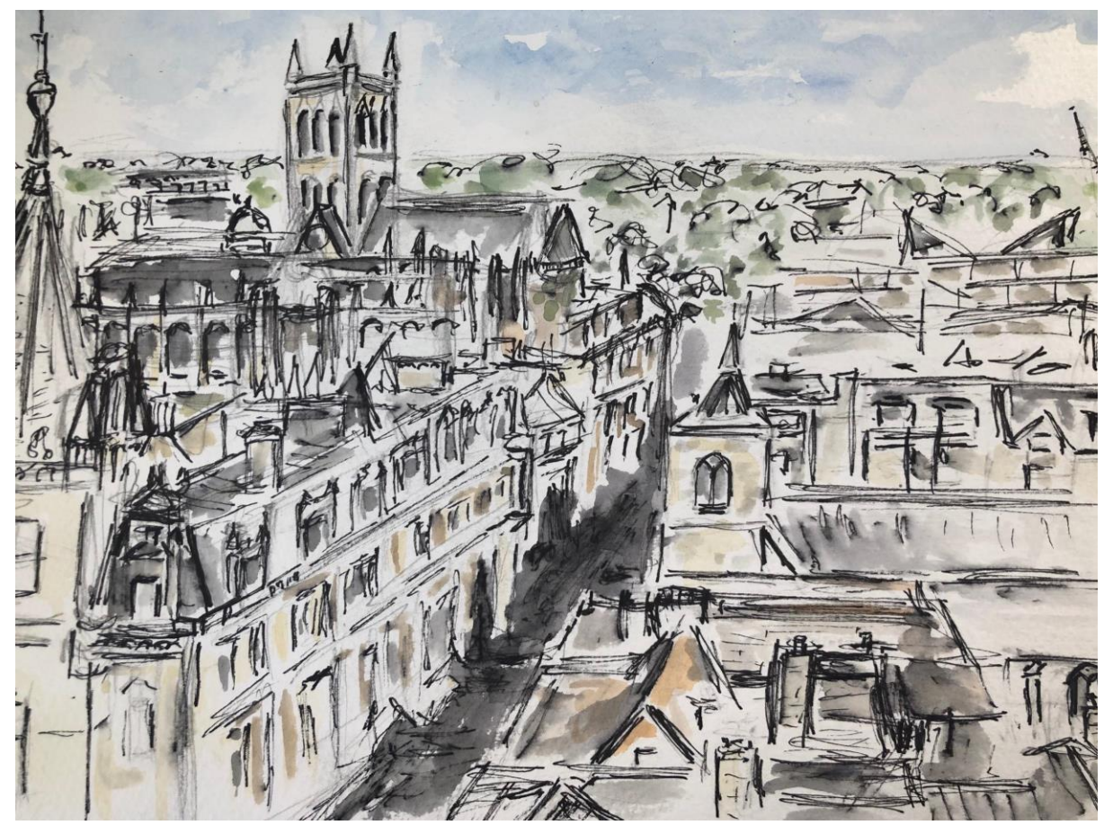
View from the Tower of Great Saint Mary's