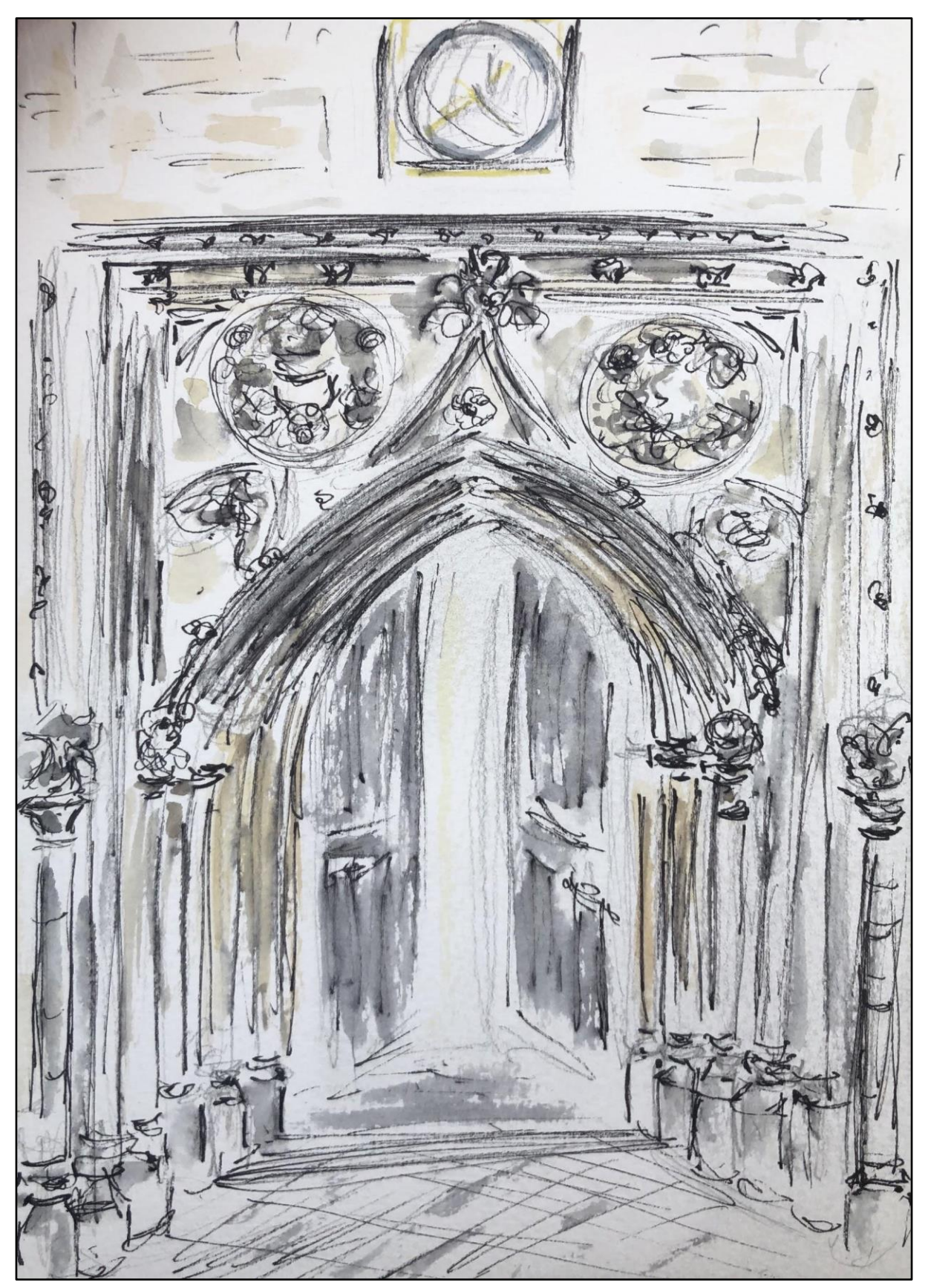
West Door of Great Saint Mary's